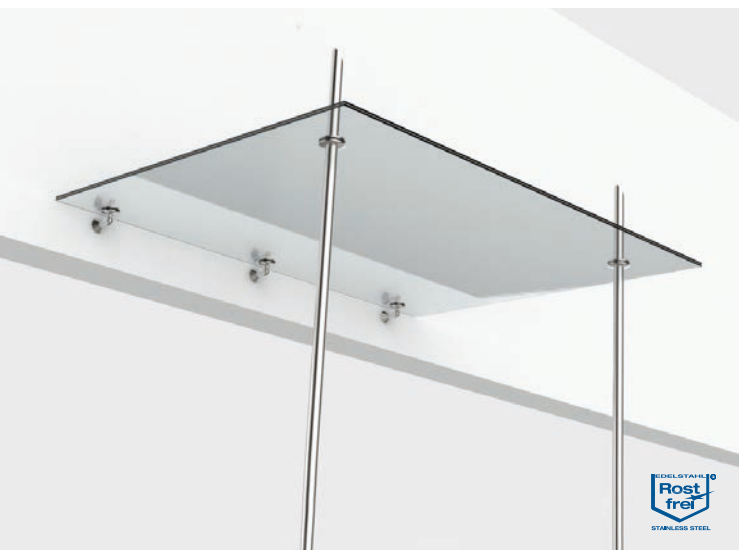
VD TYP A-02 Edelstahl (A2) | TYPE A-02 Stainless steel (304)