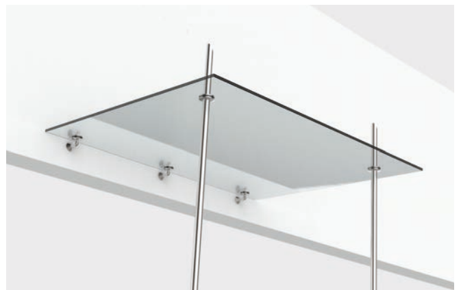
TYP A-02 TYPE A-02