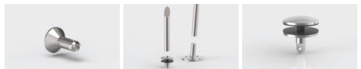
3x 1981VA 2x 1989VA-5G 3x 1926VA