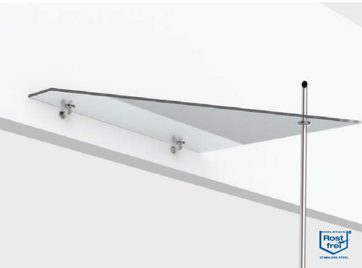
VD TYP A-01 Edelstahl (A2) | TYPE A-01 Stainless steel (304)